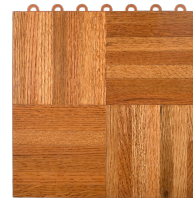
Dark Oak Parquet