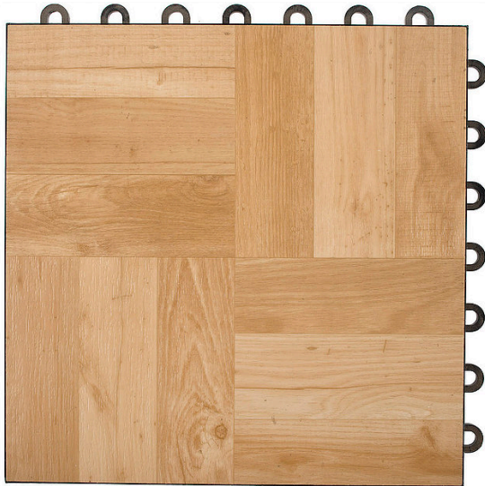
Vinyl Dance Tile