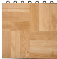
Light Oak Parquet