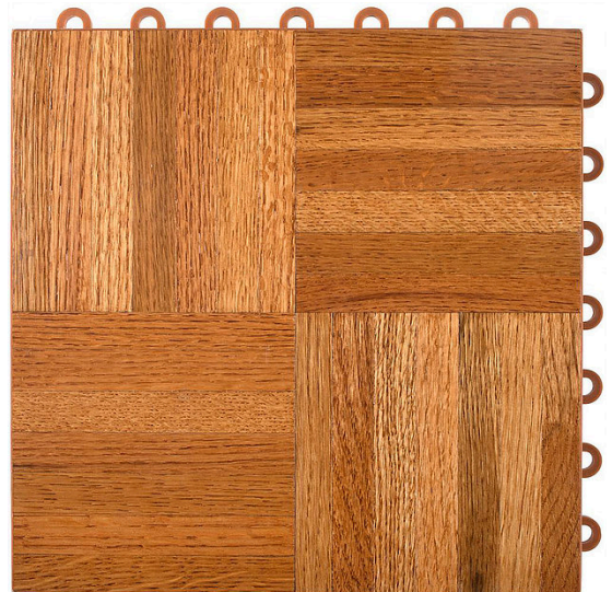
Wood Dance Tile