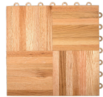
Light Oak Parquet

COVERDECK SYSTEMS® VINYL DANCE FLOOR is an affordable, easy to install, alternative to wood. Each vinyl finish of simulated wood parquet or solid color slate is inserted into a sturdy and water-resistant polypropylene base. Because the VINYL DANCE FLOOR is manufactured using a high impact polypropylene, these portable dance floor modules may be used both indoors and outdoor ground surfaces (avoid prolonged exposure to direct sunlight and the elements). Unlike other types of dance floors on the market, the VINYL DANCE FLOOR is nonabsorbent and allows any water to flow freely underneath.